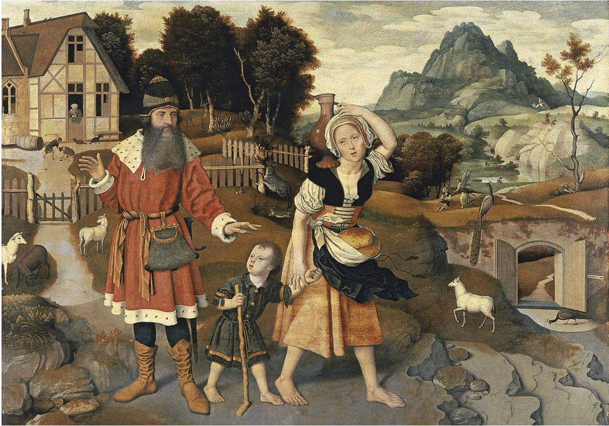
'The Banishment of Hagar' by Jan Mostaert, c. 1620–25, Thyssen-Bornemisza Museum.

This Assyrian idea of a wife sourcing a handmaiden to bear her husband's child is paralleled in the story of Hagar and Sarai (later called Sarah). As described in Genesis 11 and 16, Sarai, Abram's wife (later Abraham), "saw she was barren." She then offers to Abram, "Consort with my maid; perhaps I shall have a son through her." "Hagar the Egyptian" was made her husband's concubine and became pregnant.