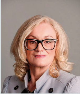
Senator Sharon Keogan Independent