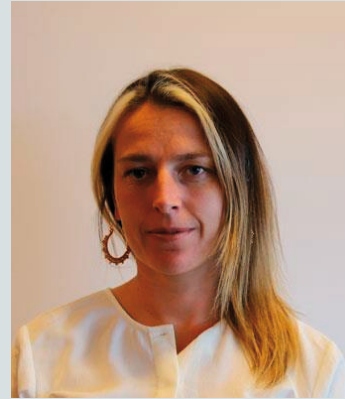
Senator Lynn Ruane Independent