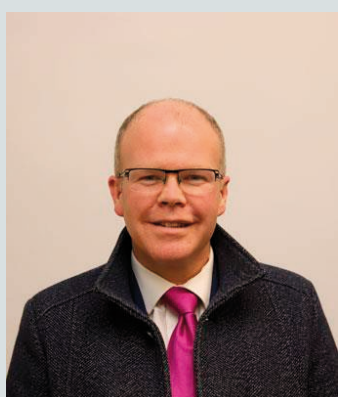
Peadar Tóibín TD Aontú