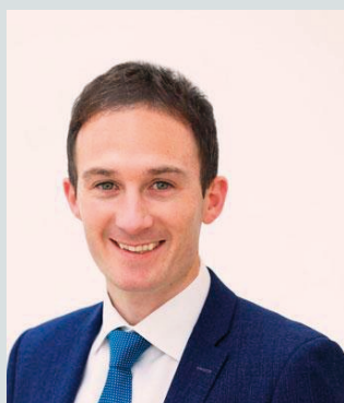
Alan Dillon TD Fine Gael