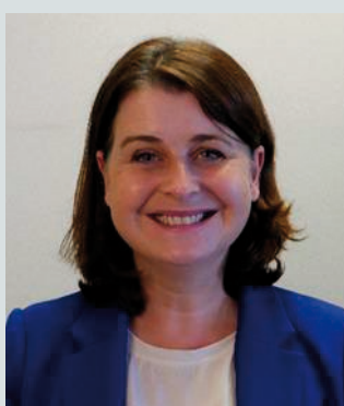
Jennifer Whitmore TD Social Democrats (Cathaoirleach)